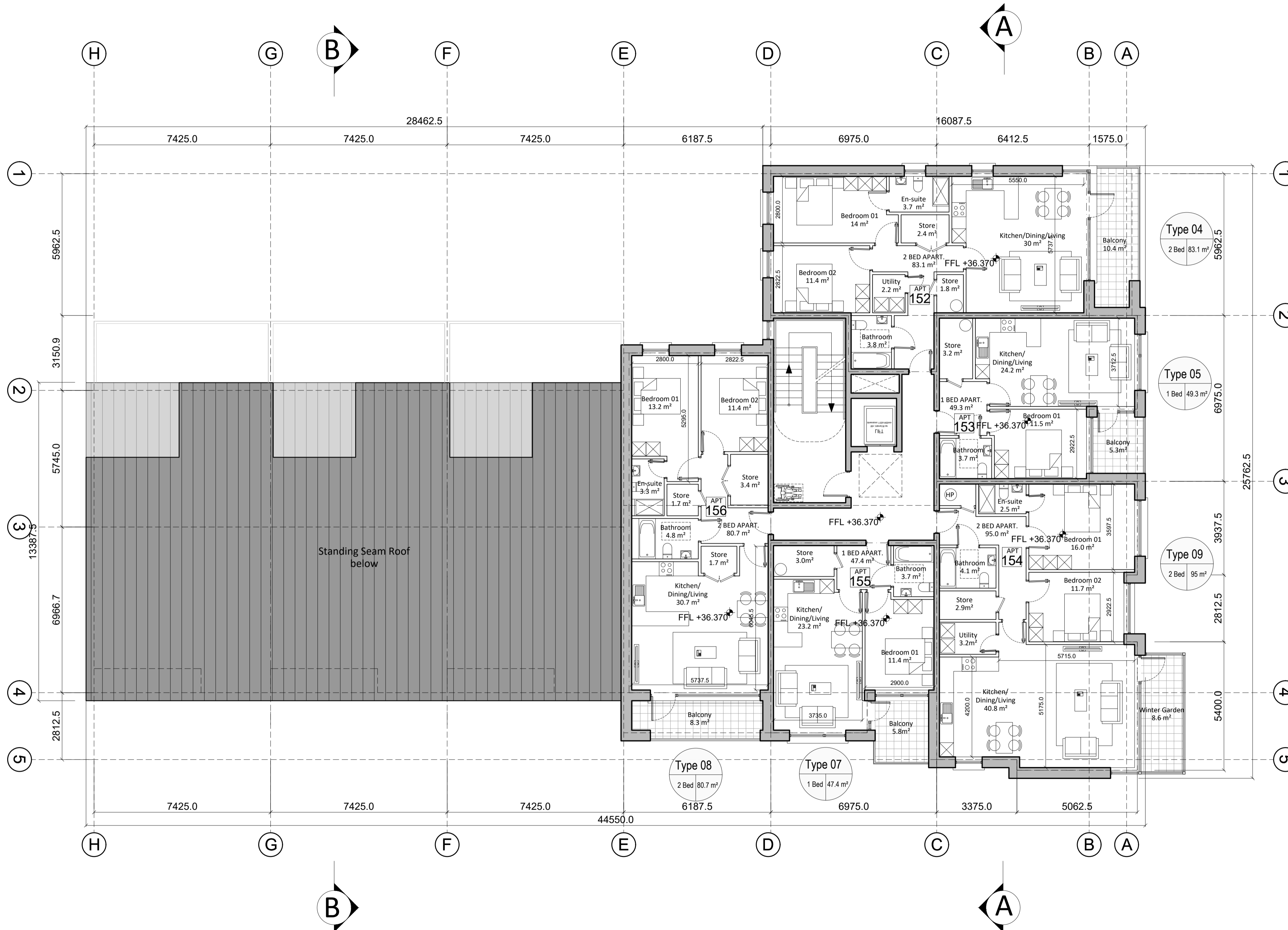
Third Floor Plan

NOTE: Do not scale from this drawing, written dimensions only to be used. This drawing is for planning purposes only & not for construction. Levels shown are for information purposes only & may not relate to O.S. Malin Head Datum. For actual O.S. Malin Head Datum always refer to the Site Layout Plan. DDA Architects Ltd. retain copyright and ownership of this design which is not transferable.